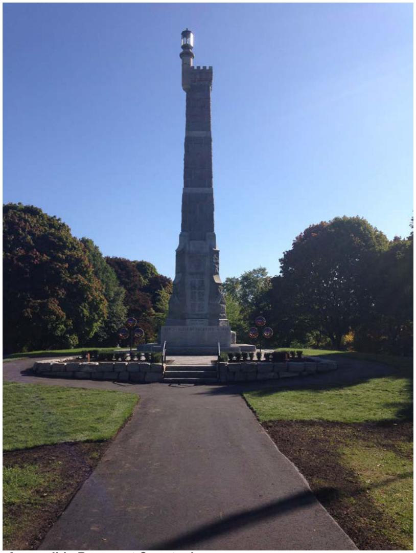
Accessible Ramps at Cenotaph