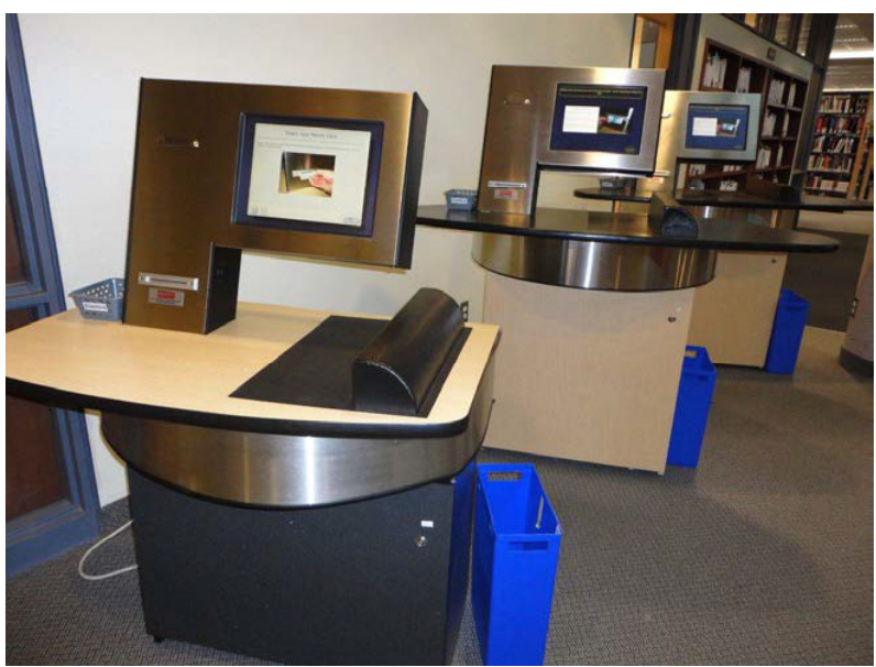
Accessible Library Self-checkout Station