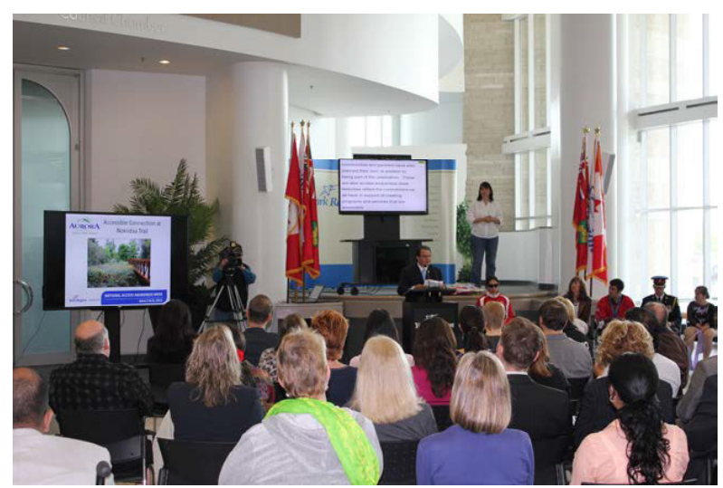
National Access Awareness Week