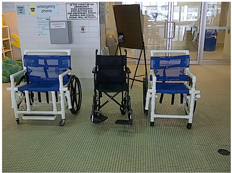
Various Mobility Aids for Patron Transfers at SARC