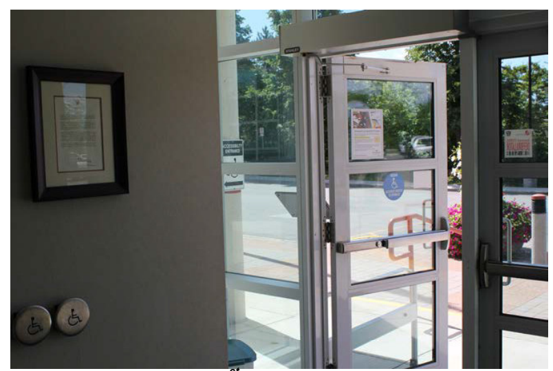
Automatic Door Openers 1<sup>st</sup> Floor Town Hall entrance