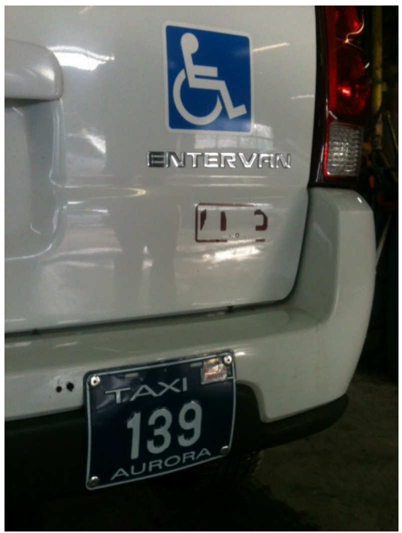
Identification of Aurora Accessible Taxicab