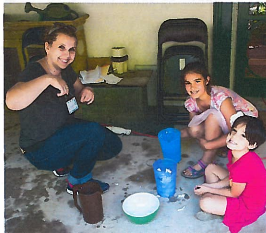
History Camp, Paper Making

Thanks to the Town of Aurora's contribution, AHS continues to offer a wide variety of curriculum based school programming. Programs include Lest We Forget "Aurora and Remembrance Day" (K-3, 6), Community Life (Grade 1), Changes in Healthcare (Grade 12) and the World Wars (Grade 10).