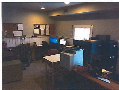
Newly renovated AHS Office

In 2017 the Board of Directors began creating a pro-active plan towards the maintenance and restoration of Hillary House. This plan was summarized in the 2018 Strategic Plan and work will take place over the next five years.