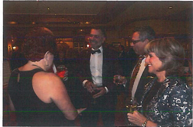
Hillary House Victory Ball, 2018.

We had a successful year, projecting raising $61,800 in 2018. This includes the sold-out Hillary House Ball, Scotch Tasting, and Mother's Day Tea. These results reflect the efforts of our highly engaged Hillary House Ball Committee and the support of countless volunteer hours.