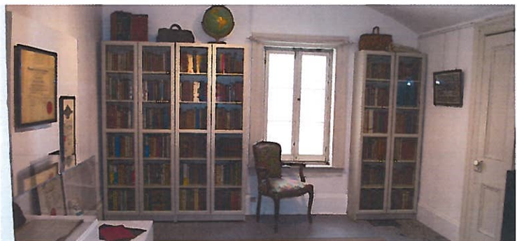
The Godfrey Collection on display in Hillary House Exhibit Room