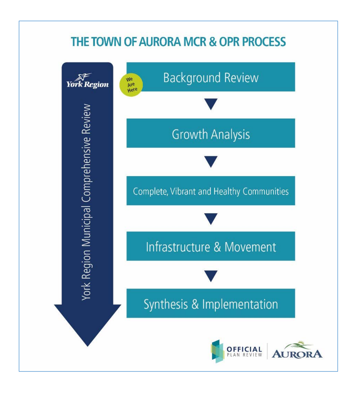
Attachment 1: Town of Aurora MCR & OPR Process