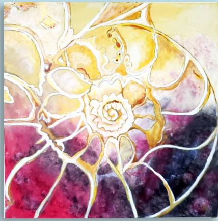
- Spiral of Life

View this online gallery at aurora.ca/skylightgallery .